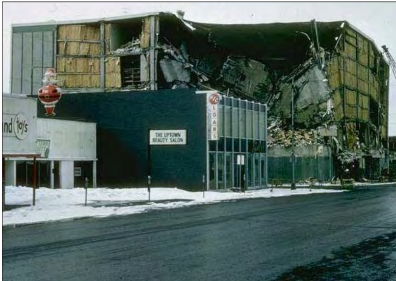
Figure 2. Collapse of the J.C. Penney building in Anchorage as a result of strong ground shaking during the 1964 earthquake.