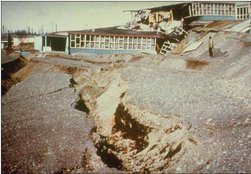
Figure 1. Destruction of Government Hill School in Anchorage as a result of landsliding triggered by the 1964 earthquake.