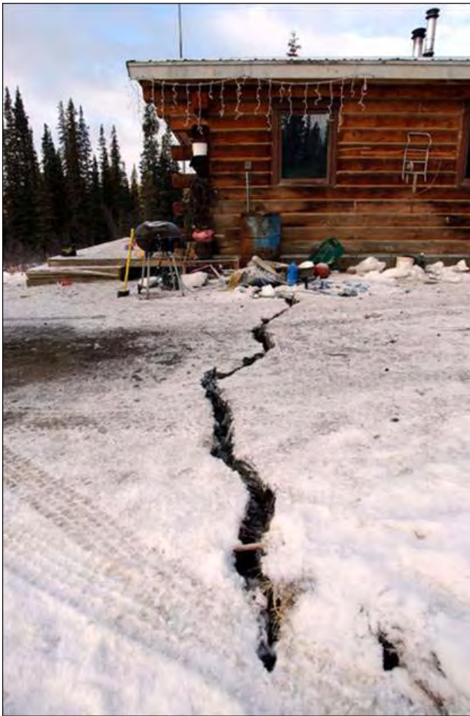
Figure 4. Ground cracking in Mentasta as a result of the 2002 magnitude 7.9 Denali fault earthquake.