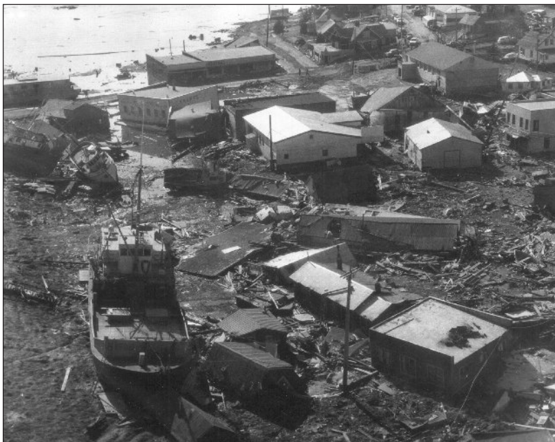
Figure 3. Tsunami damage in Kodiak resulting from the 1964 earthquake.