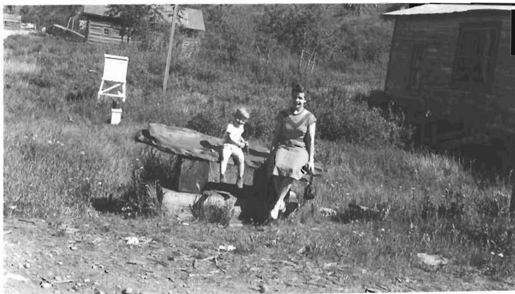
June 26, 1953 Chitina. 2400 lb slab of native copper