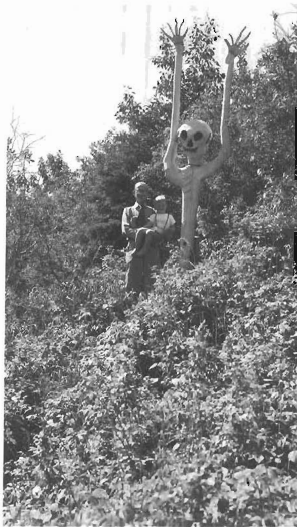
"Greeter" on highway to Ghost Town of Chitina