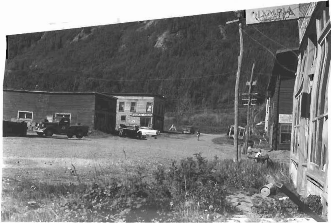
June 26, 1953 Chitina business district