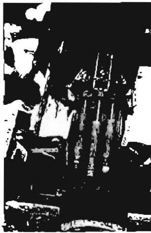
Straub mill, Golden Horn Mine.

Iditarod District has been almost entirely confined to placer. The owners of the Golden Horn have had no milling or lode mining experience. The mill has not been operated by the present owners. A new mill is planned after the matter of title has been settled. The present mill equipment is in need of repair and is not adequate to solve the problem of efficient ore concentration. A 6 by 7 inch Dodge crusher with a No. 1 Straub ten-stamp mill were used before plate amalgamation.