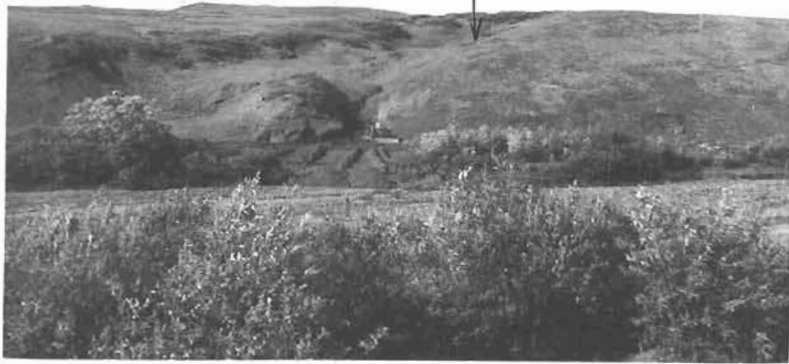
Photograph of Gray Eagle property. Dozer trenching done as shown and below face of small bluff to left of dozer. Further trenching should be done in high area indicated by arrow.