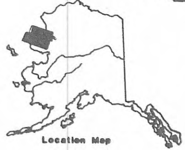
FIGURE 2 GEOCHEMICAL ANOMALIES AND MINING CLAIMS MAP, NORTHWESTERN SEWARD PENINSULA, ALASKA