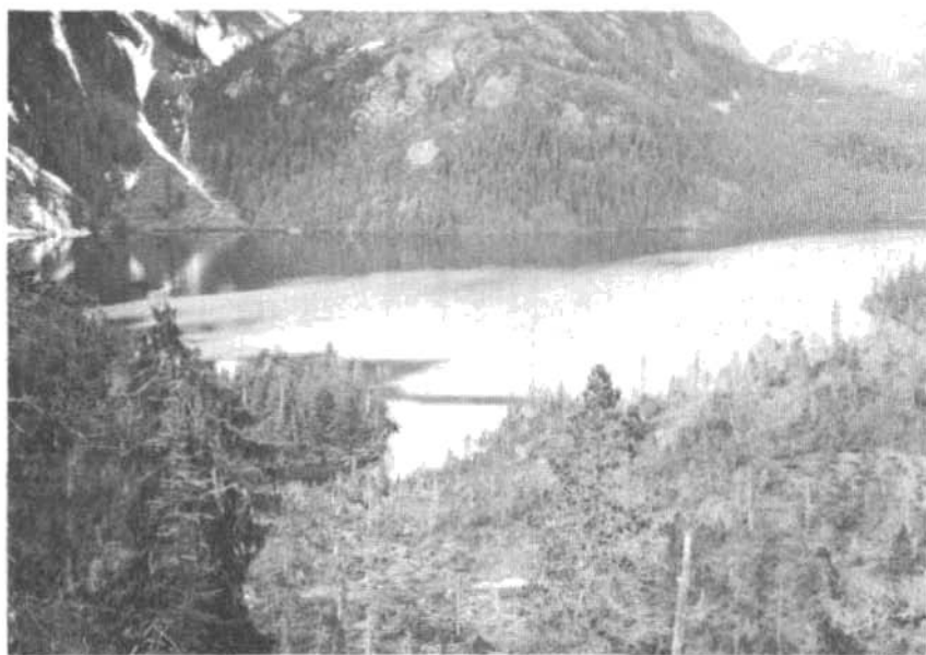
FIGURE 4.—View southwestward across lower end of Baranof Lake. Lake outlet in lower left center of view.