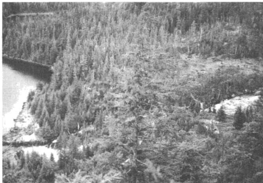
FIGURE 5.—Shore of Warm Spring Bay south from mouth of Baranof River. Note lagoon in upper left part of view.

Development of the Baranof Lake powersite could be accomplished by the construction of a dam at the lake outlet of sufficient height to obtain the required storage for regulation of the streamflow. The water could be conveyed by a conduit from the resulting reservoir to a powerhouse located either on the shore of Warm Spring Bay about 250 feet south of the mouth of Baranof River or on a tidal lagoon 2,100 feet south of the river mouth (fig. 5). The conduit would be either a pipeline or tunnel, or a combination of both. If the powerhouse were located at a point about 250 feet from the mouth of