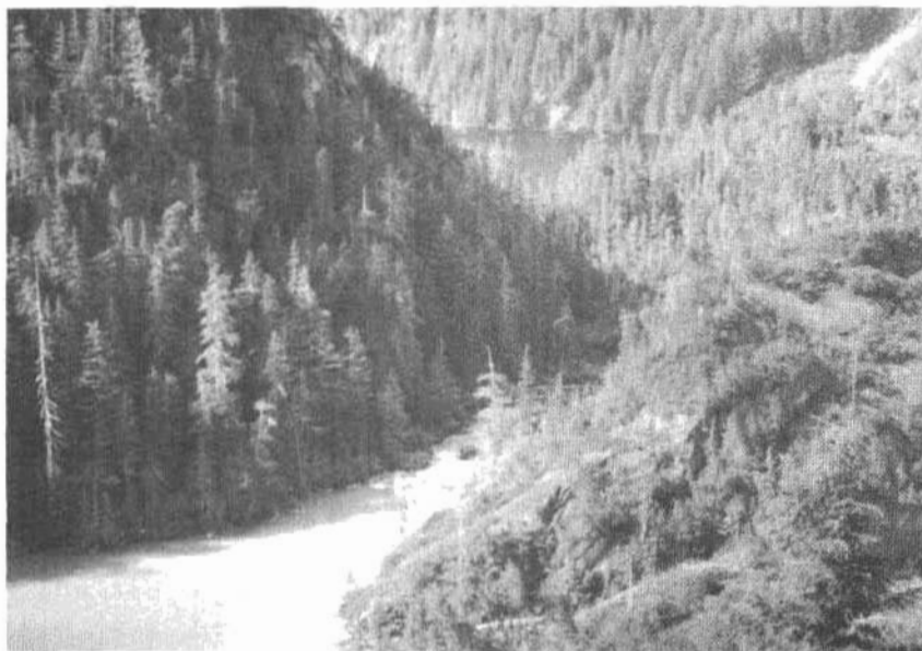
FIGURE 7.—Carbon Lake outlet. Probable axis for dam would cross channel at upper end of rapids. Unnamed lake in upper center part of view drains into Coal Creek 650 feet downstream from Carbon Lake outlet.

capacity. Along section C-C' , bedrock is exposed or is covered by a thin layer of overburden, except at two places where there is an estimated 20 to 30 feet of unconsolidated material. One of these areas extends from the right (east) bank of Coal Creek to the left (west) abutment up to about altitude 280 feet. There is an estimated 10 feet of alluvium in the river channel and as much as 20 feet of mixed talus, topsoil, and silt on the left bank. The second area extends from the toe of the south valley wall near altitude 215 to altitude 270 feet. A rock slide has occurred here, and large blocks as much as 20 feet in diameter are stacked at the base of the slope. The depth to bedrock may be as much as 30 feet, and possibly more if the toe of the rock slope has been undercut. On the valley wall above the slide from an altitude of 270 to 360 feet, there is a thin layer of overburden and talus. Bedrock is exposed from an altitude of 360 to 400 feet. The rock face on the south valley wall and the rock face on the right (east) side of Coal Creek at section C-C' are controlled by the dip of the foliation.