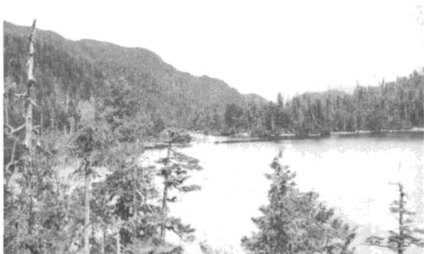
FIGURE 3.—East end of Baranof Lake. Outlet of lake is slightly left of center of view.