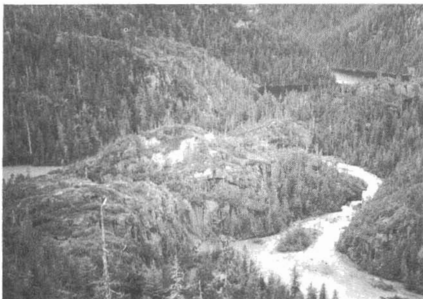
FIGURE 6.—Rock ridge at east end of Carbon Lake. Lower end of Carbon Lake in left edge of view. Unnamed lake in upper right part of view drains into Coal Creek 650 feet downstream from Carbon Lake outlet.

Between the two knobs, the ground surface descends to within a few feet of the lake surface, and during periods of high water, a small stream flows through the saddle. Between the lower knob and the south valley wall, the ground surface is 5 to 6 feet above lake level. Water has not flowed through this saddle recently.