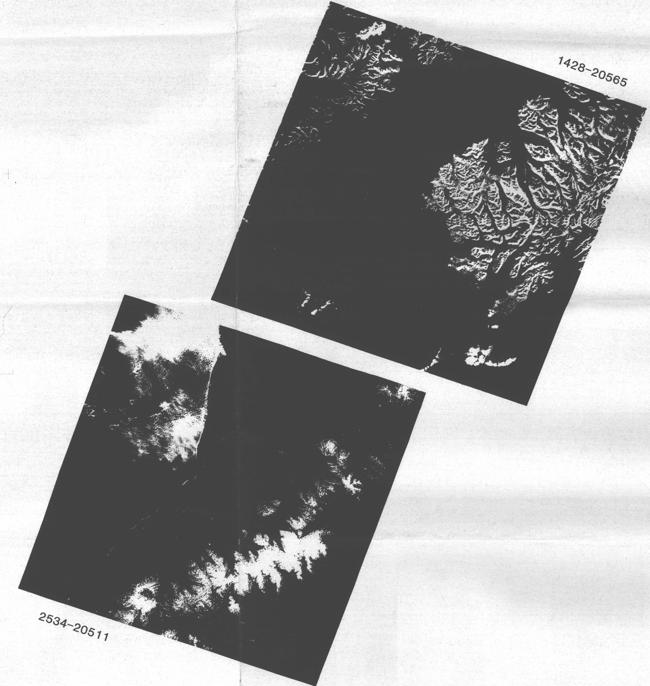
Figure 2. Example of imagery used in analyses of the Ugashik and Karluk quadrangles. Band 7.