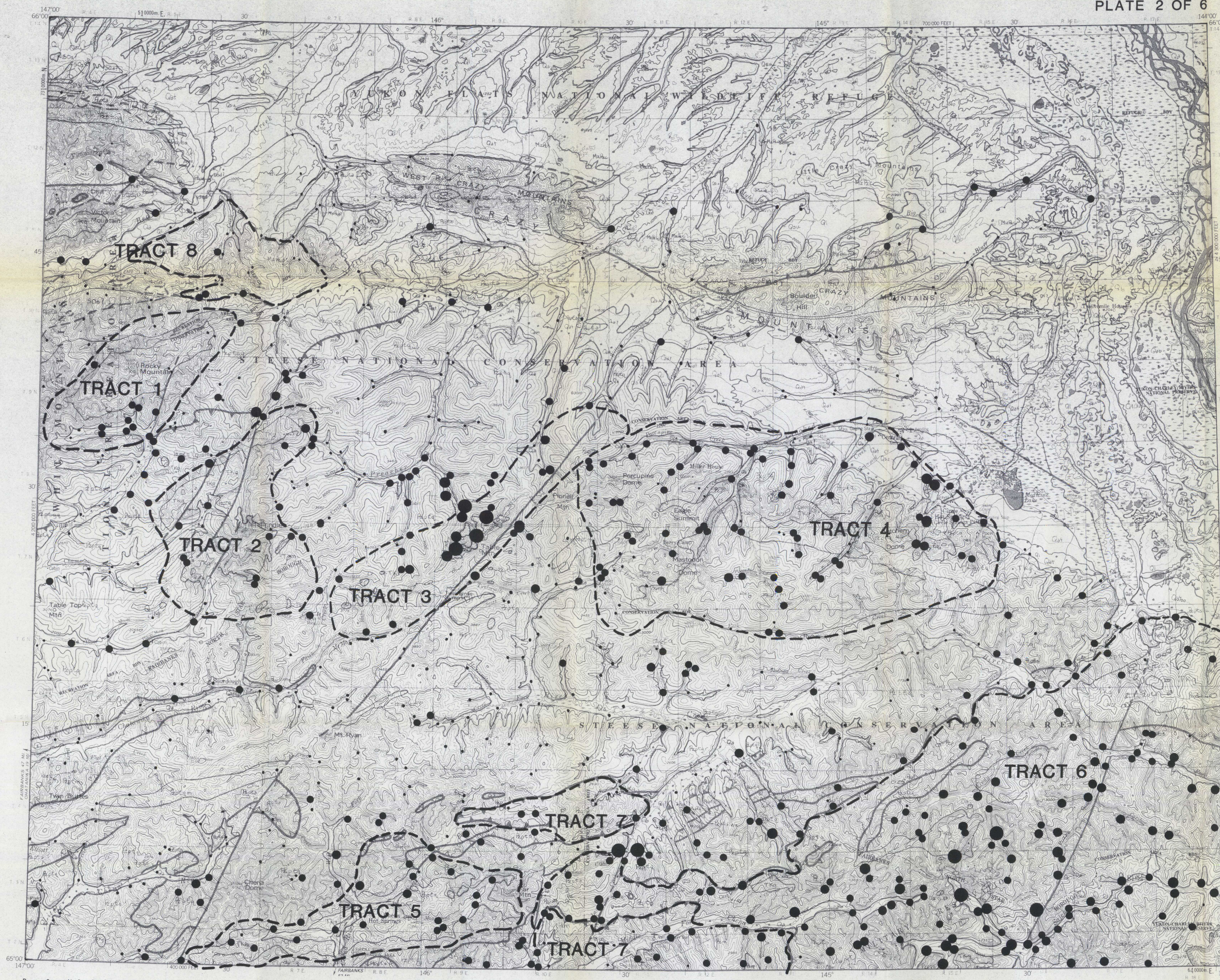
MAP F-4 MAP SHOWING DISTRIBUTION OF SCHEELITE