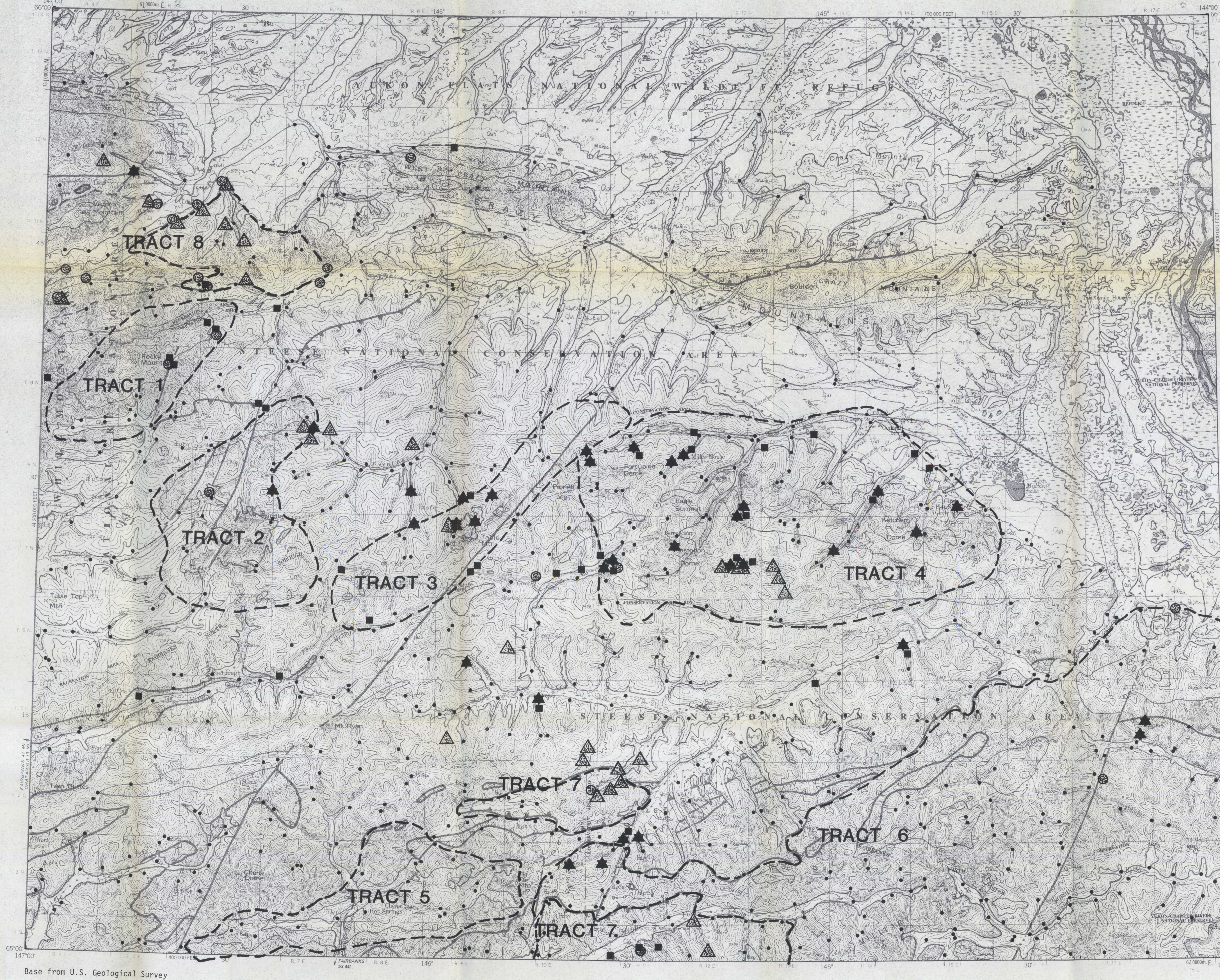
MAP F-3 MAP SHOWING DISTRIBUTION OF ARSENOPYRITE, CHALCOPYRITE, GALENA, AND SPHALERITE