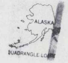
PLATE 1-LOCALITIES FOR WINTER MOOSE PELLET SAMPLES COLLECTED IN THE TANACROSS QUADRANGLE, ALASKA By

This map is preliminary and has not been edited or reviewed for conformity with U.S. Geological Survey editorial standards or stratigraphic nomenclature