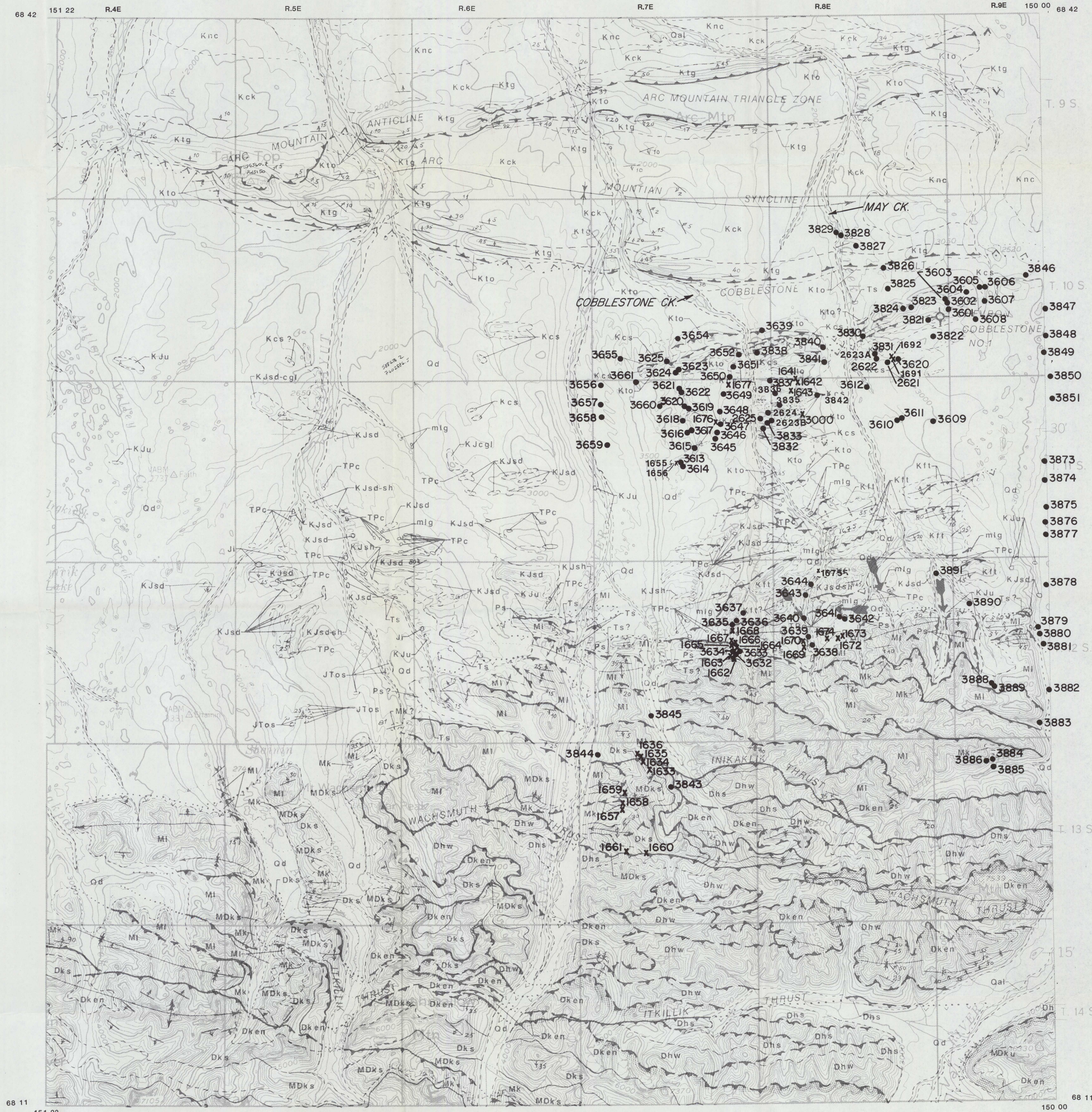
LOCALITY MAP OF STREAM-SEDIMENT AND ROCK SAMPLES COLLECTED IN 1986, COBBLESTONE CREEK STUDY AREA, CHANDLER LAKE QUADRANGLE, ALASKA

Dh HUNT FORK SHALE (Devonian)-- Comprised wacke and shale members, undifferentiated; mostly shale and sandstone. Medium-dark-gray and olive-gray shale; includes argillite with poorly developed cleavage, grades to slate, poorly developed phyllitic sheen on cleavage, and argillite interbeds. Grayish-