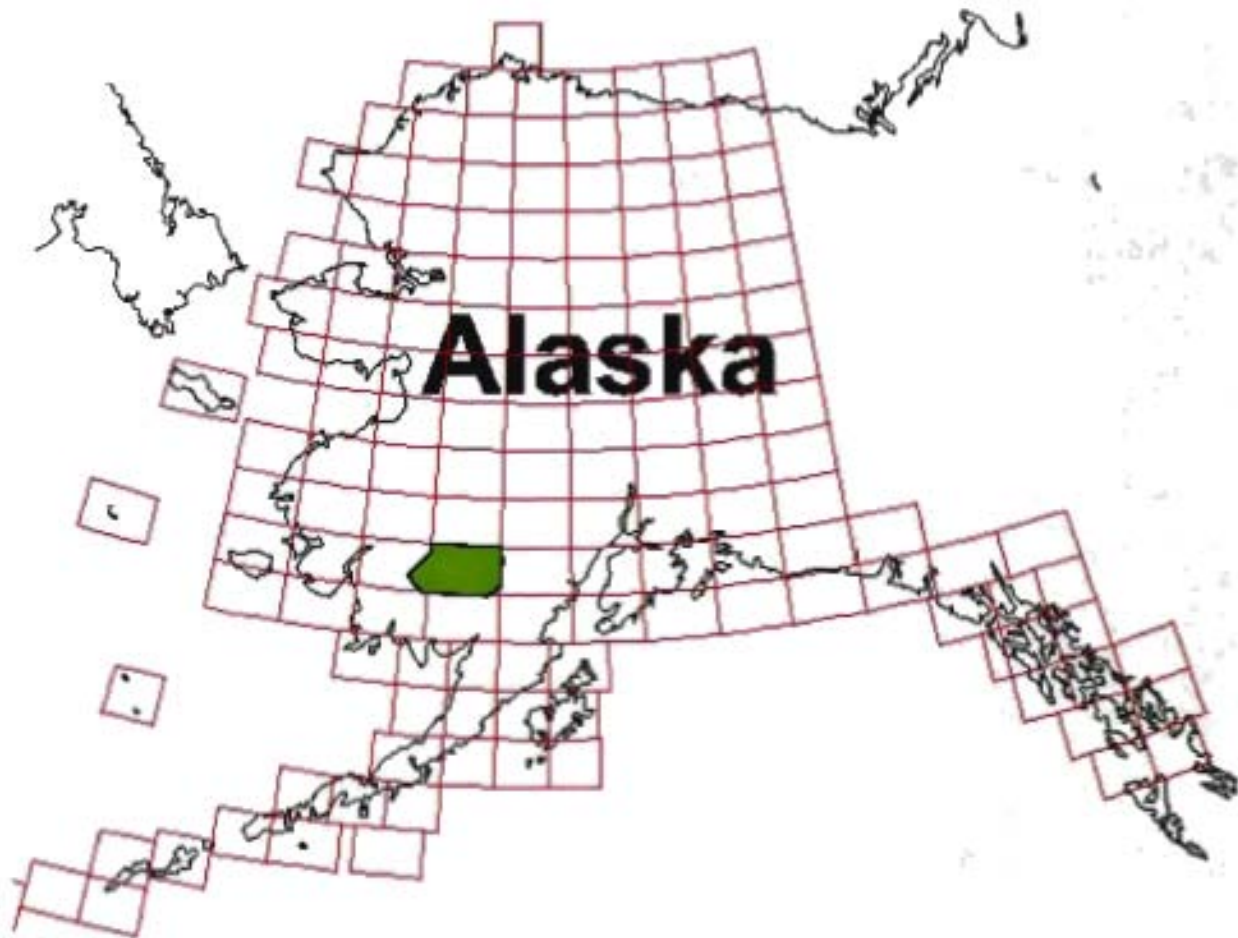
Figure 1. Location map for the Taylor Mountains aeromagnetic survey (green patch). Coast lines are in black. Alaska 1:250,000 quadrangle boundaries are in red. The survey occupies the Taylor Mountains quadrangle and a portion of the Bethel quadrangle in southwestern Alaska.