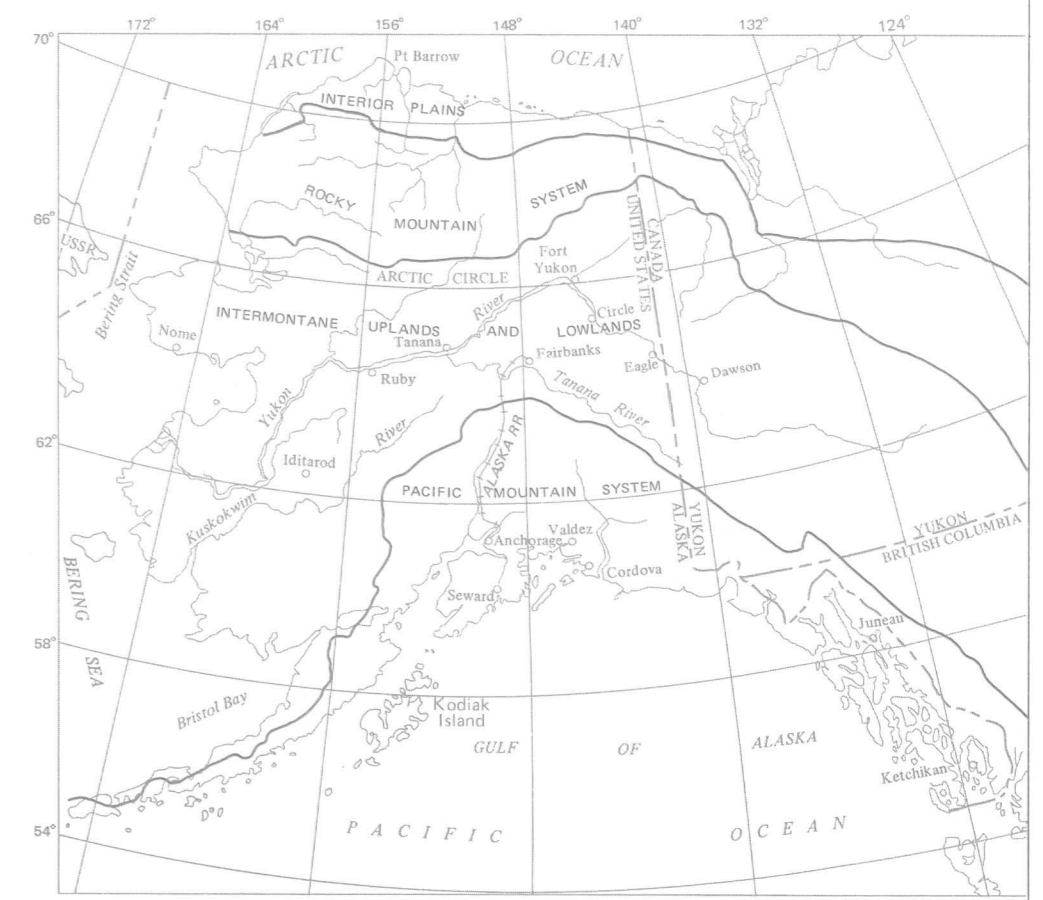
MAJOR NORTH AMERICAN PHYSIOGRAPHIC DIVISIONS IN ALASKA