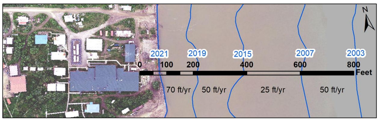
Figure 1. Kuskokwim River shorelines (blue) in relation to the school. The image is from the June 29, 2021 drone survey. The average erosion rate from 2003 to 2021 is 40 feet per year. Recent rates are 50 to 70 feet per year. The school is 79 feet from the bank and about 260 feet long.