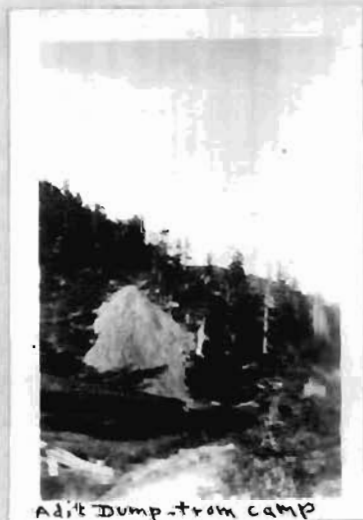
Adit Dump from camp

The property of the Chomley Mining Company is situated on the west shore of the south arm of Cholmondeley Sound. The surface showings are located on the crest of the mountain at an elevation of 2500 feet. The property was located in 1906 and sold to the Alaska Galena Company who did desultory development work. The property was later acquired by the Chomley Mining Company, a corporation owned largely by Ketchikan men. This company undertook to develop the property on an extensive scale. About $60,000 was expended with unsatisfactory results and the property was closed down in 1924.