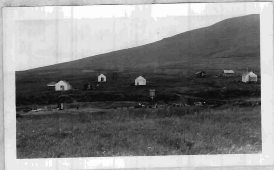
Camp of Clara Creek Mining Company.