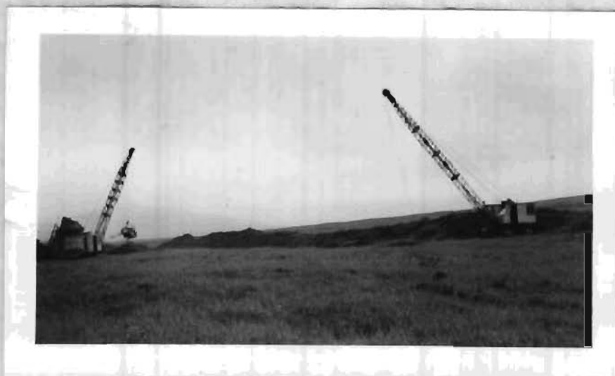
Two draglines stripping on Platinum Creek, Goodnews Bay Mining Company.

Prior to this season this company mined with draglines. Squirrel Creek has been mined to its head where numerous large boulders made this operation impractical. This season the two draglines were working together on upper Platinum Creek. This enables the operators to take a strip from 150 to 175 feet in width.