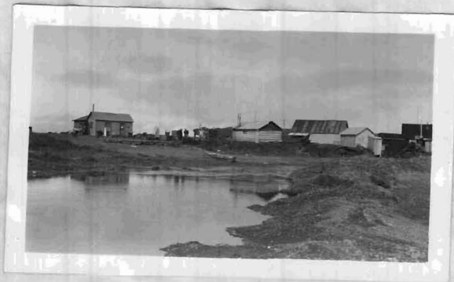
Town of Platinum.