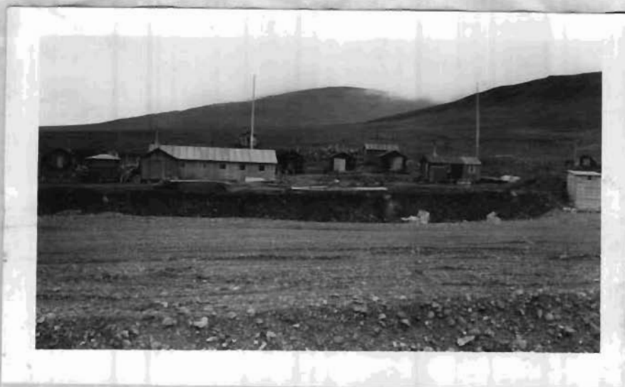
Camp of Goodnews Bay Mining Company, Squirrel Creek--condemned aviation field in front.

Prior to this season this company mined with draglines. Squirrel Creek has been mined to its head where numerous large boulders made this operation impractical. This season the two draglines were working together on upper Platinum Creek. This enables the operators to take a strip from 150 to 175 feet in width.