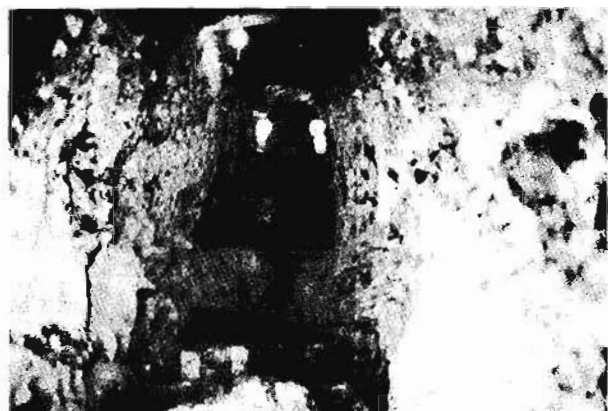
Main tunnel level, WRV drift mine.

USSR&M Company and others; these efforts managed to mine ground previously worked by Alaskan drift miners.