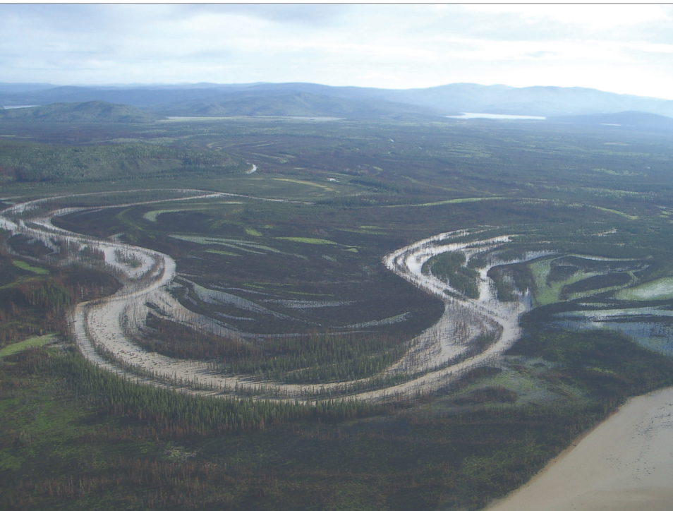
Oblique aerial view of discontinuous permafrost in the Tanana River lowlands, Tanacross B-5 Quadrangle. Photograph taken 7/26/2010.