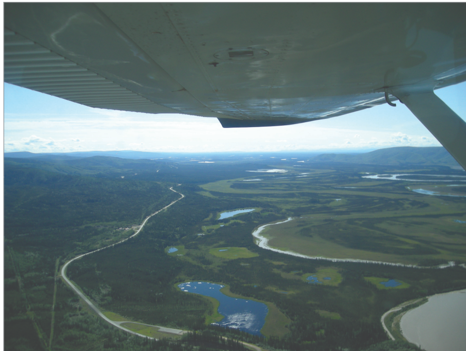
Oblique aerial view of discontinuous permafrost in the Tanana River lowlands, Tanacross B-4 Quadrangle. Photograph taken 6/12/2007.