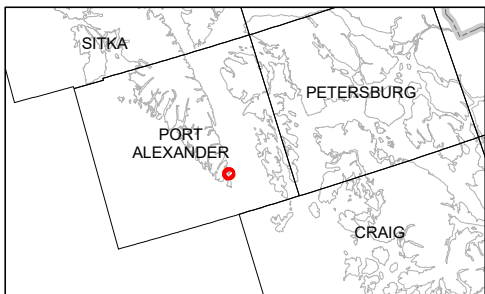
LOCATION OF MAP AREA

Base map from: Bing Maps Aerial Projection: Alaska State Plane Zone 1 (Feet) Datum: North American Datum of 1983