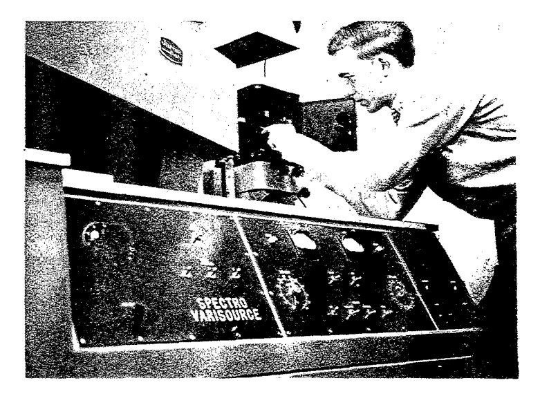
Figure 1-Portion of the spectrograph unit recently installed in the laboratory

Some difficulty has been experienced in obtaining consistent and accurate geochemical analysis in the field. Current laboratory investigations are therefore being conducted to either determine and resolve the factors which introduce error, or to designate more accurate alternative methods.