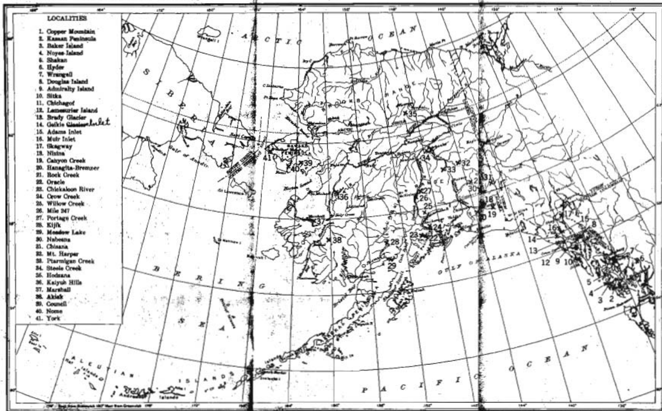
MAP OF ALASKA SHOWING LOCALITIES WHERE MOLYBDENUM MINERALS HAVE BEEN FOUND.