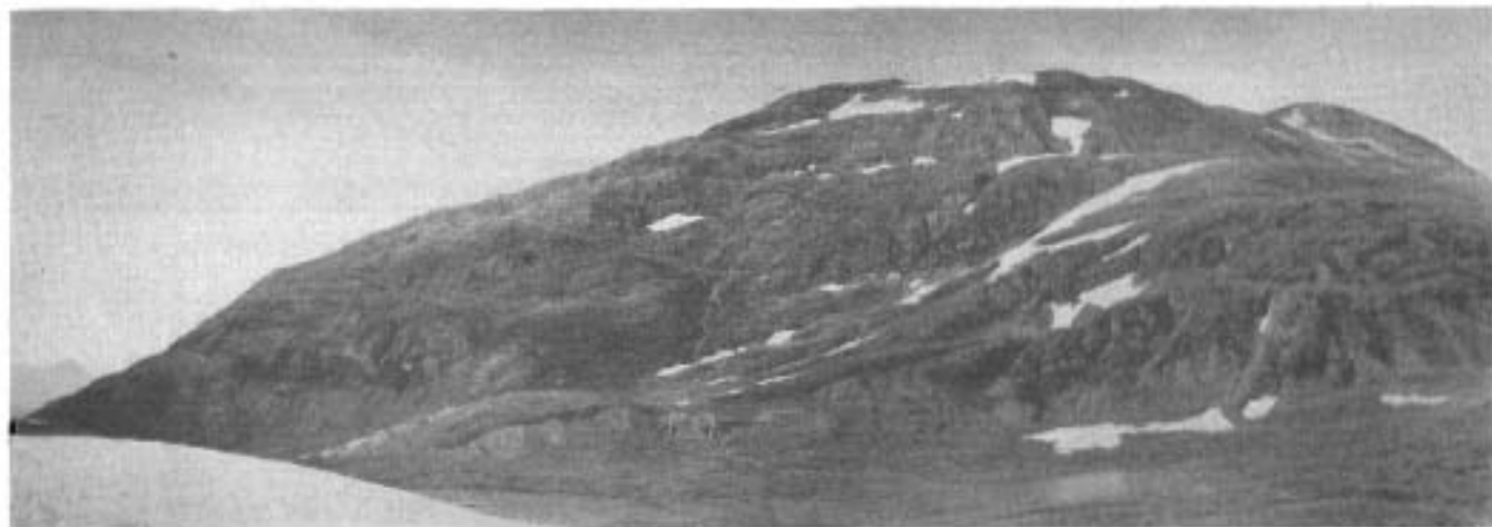
SOUTH SLOPE OF PORTAGE SHOULDER. Divide Lake and part of Portage Glacier in foreground.