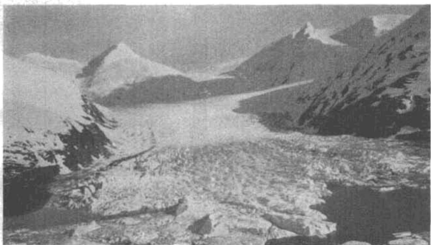
B. LOWER PART OF PORTAGE GLACIER FROM TURNAGAIN SHOULDER.