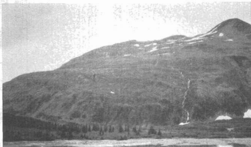
A. EAST SLOPE OF PORTAGE SHOULDER FROM HEAD OF PASSAGE CANAL.