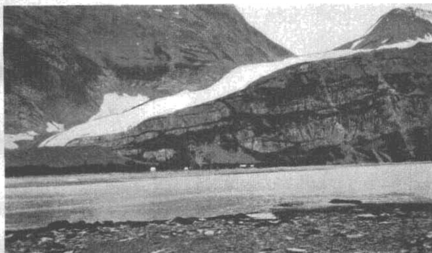
A. VIEW IN 1914, SHOWING SNOUT OF GLACIER AND PART OF THE DEBRIS-COVERED ICE RIDGE LEFT BY RECESSION OF THE GLACIER.