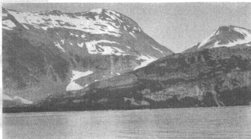
B. SAME VIEW IN 1940, SHOWING AMOUNT OF RECESSION OF THE GLACIER AND ABSENCE OF THE DEBRIS-COVERED ICE RIDGE.

VIEW ACROSS HEAD OF PASSAGE CANAL FROM THE SOUTHEAST, SHOWING LEARNARD GLACIER.