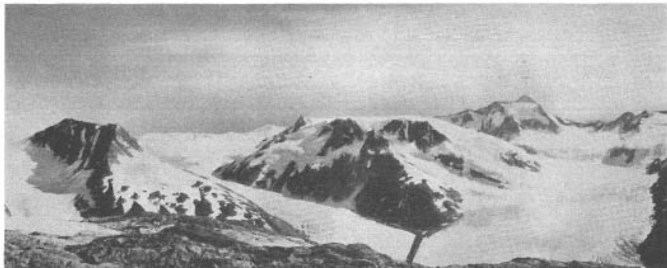
NÉVÉ FIELDS AND UPPER PART OF FORTAGE GLACIER, FROM FORTAGE SHOULDER.