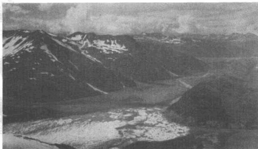
B. VIEW WEST FROM PORTAGE SHOULDER DOWN PORTAGE VALLEY.

Shows lower end of Portage Glacier, Portage Lake, Turnagain Shoulder (on right), and mouth of Placer Valley (in right foreground).