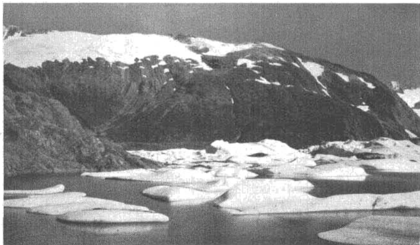
B. WEST SLOPE OF PORTAGE SHOULDER, SHOWING LARGE FOLD IN BEDS OF SLATE AND GRAYWACKE.