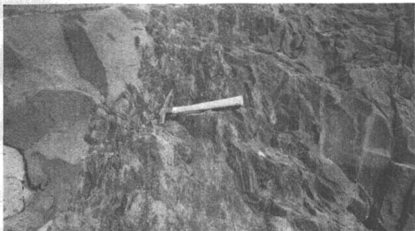
A. BRECCIA OF ARGILLITE FRAGMENTS IN MATRIX OF GRAYWACKE ON WEST SLOPE OF PORTAGE SHOULDER.