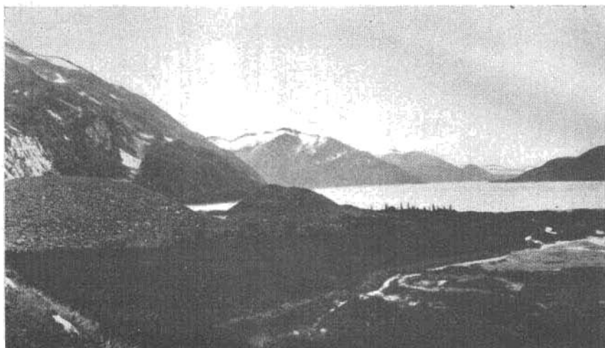
A. DEBRIS-COVERED ICE RIDGES BELOW LEARNARD GLACIER, AS SEEN FROM FOOT OF PORTAGE SHOULDER IN 1914.