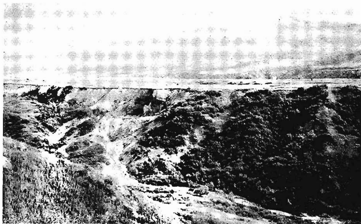
FIGURE 2. View looking east showing valley of Thunder Creek. Fred Houghman's placer workings in high level late Tertiary bench gravels. Peters Hills are shown in background.