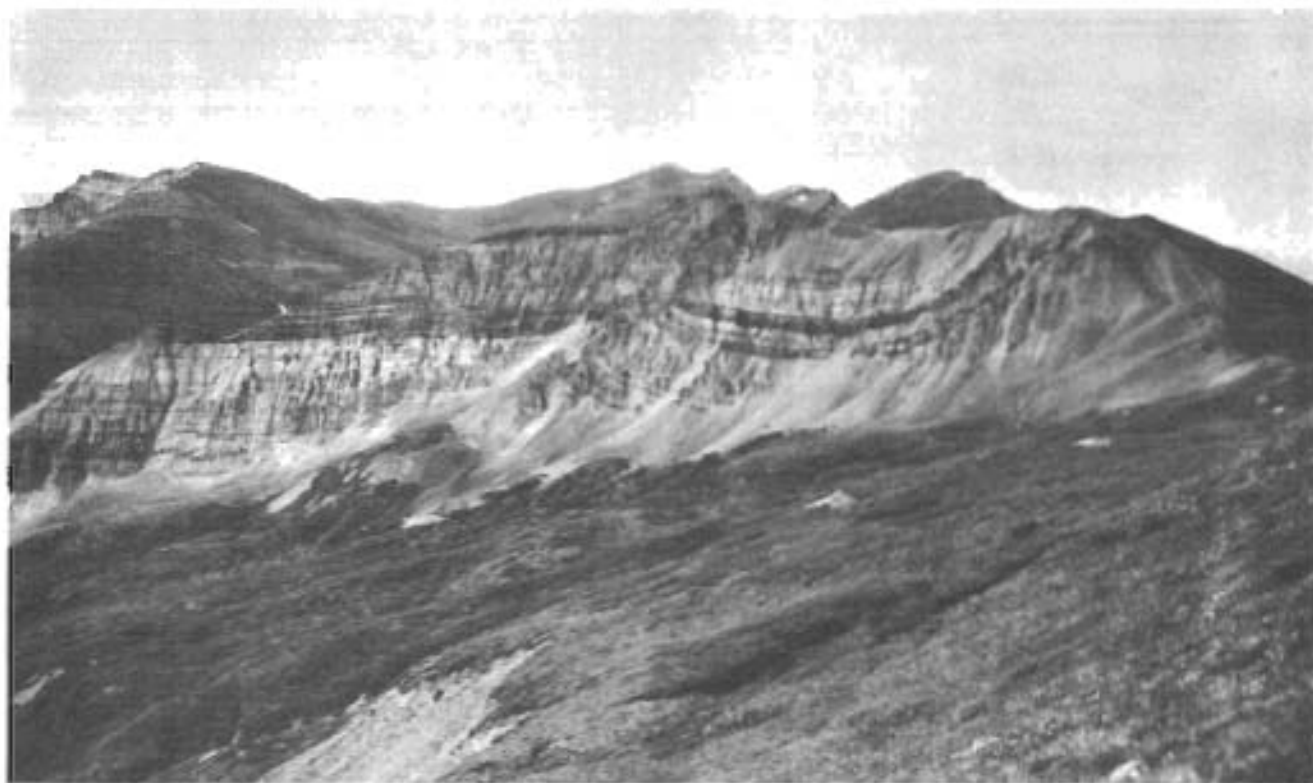
FIGURE 3.—View westward on crest of MacColl Ridge showing faulted sandstone and conglomerate of unit E_1 overlying black shale of unit E_2 at right side of photograph.