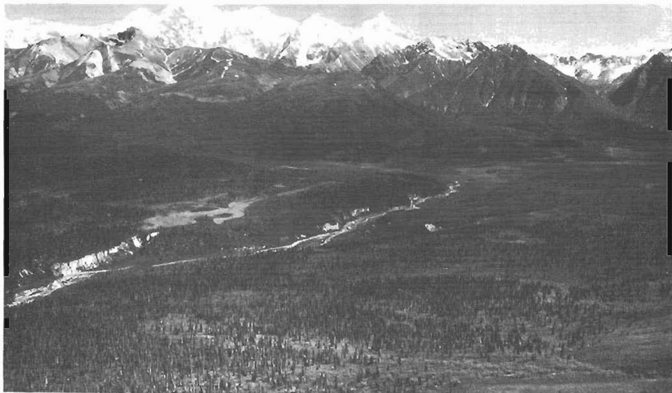
FIGURE 8.—View northward across Young Creek Valley; bluffs west of big bend in the left central part of photograph are sandstone of unit K_1 . The hills in the upper central part, east of Young Creek, are underlain by black shale of unit K_2 .