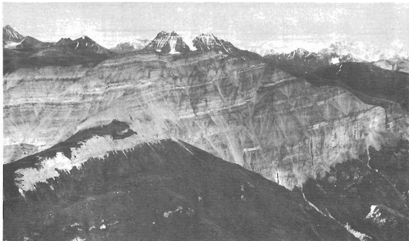
FIGURE 5.—Cliff composed of arkosic sandstone, conglomerate, and siltstone of unit K 2 , exposed on southern side of MacColl Ridge near western margin of McCarthy A-4 quadrangle. Height of exposed section is about 2,000 feet. Pyramid Peak, composed of same unit, is visible on skyline to left of center.