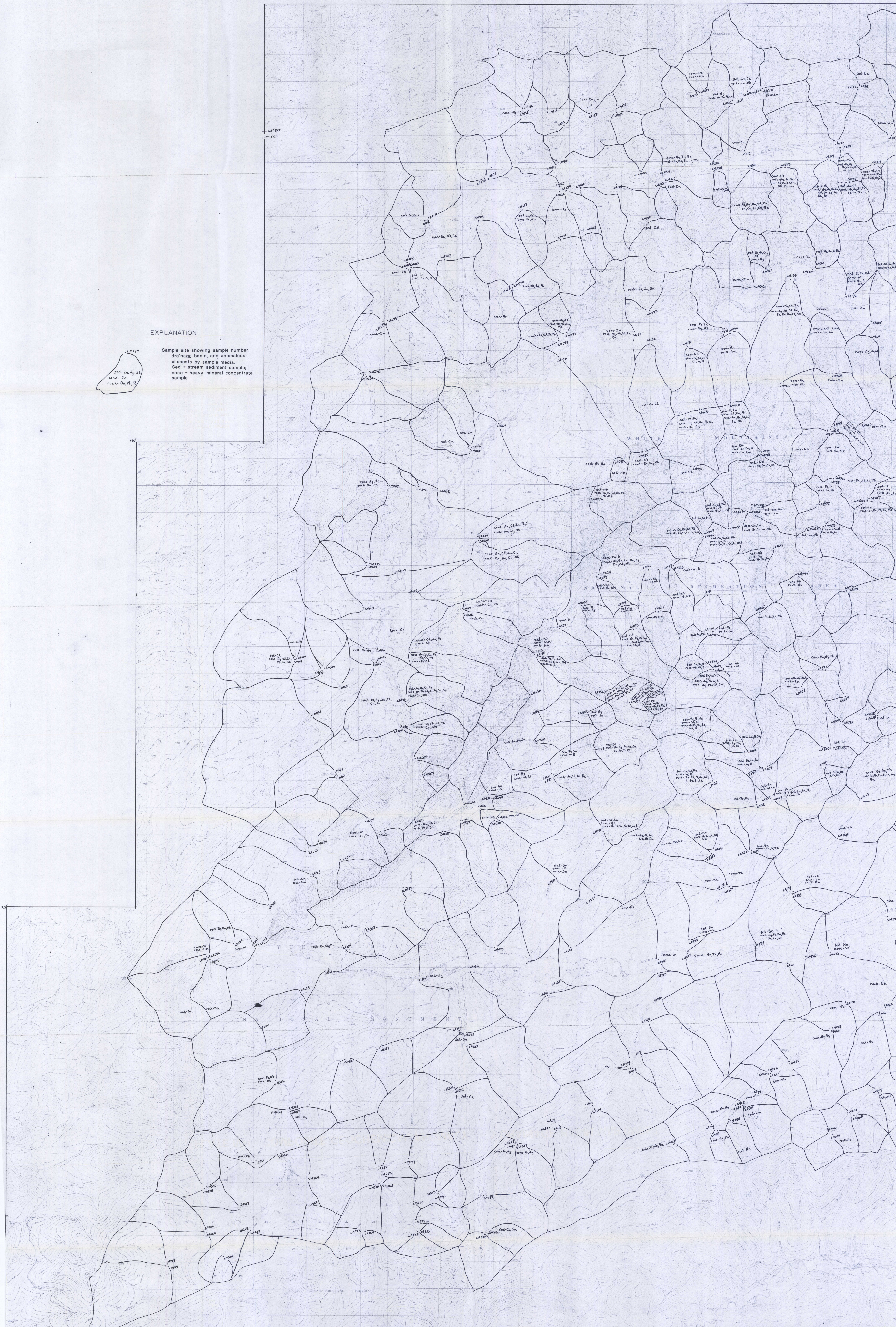
PLATE IV-Q: COMPOSITE GEOCHEMICAL ANOMALY AND DRAINAGE BASIN MAP (WEST HALF)

Sample site showing sample number, drainage basin, and anomalous elements by sample media. Sed - stream sediment sample; conc - heavy-mineral concentrate sample