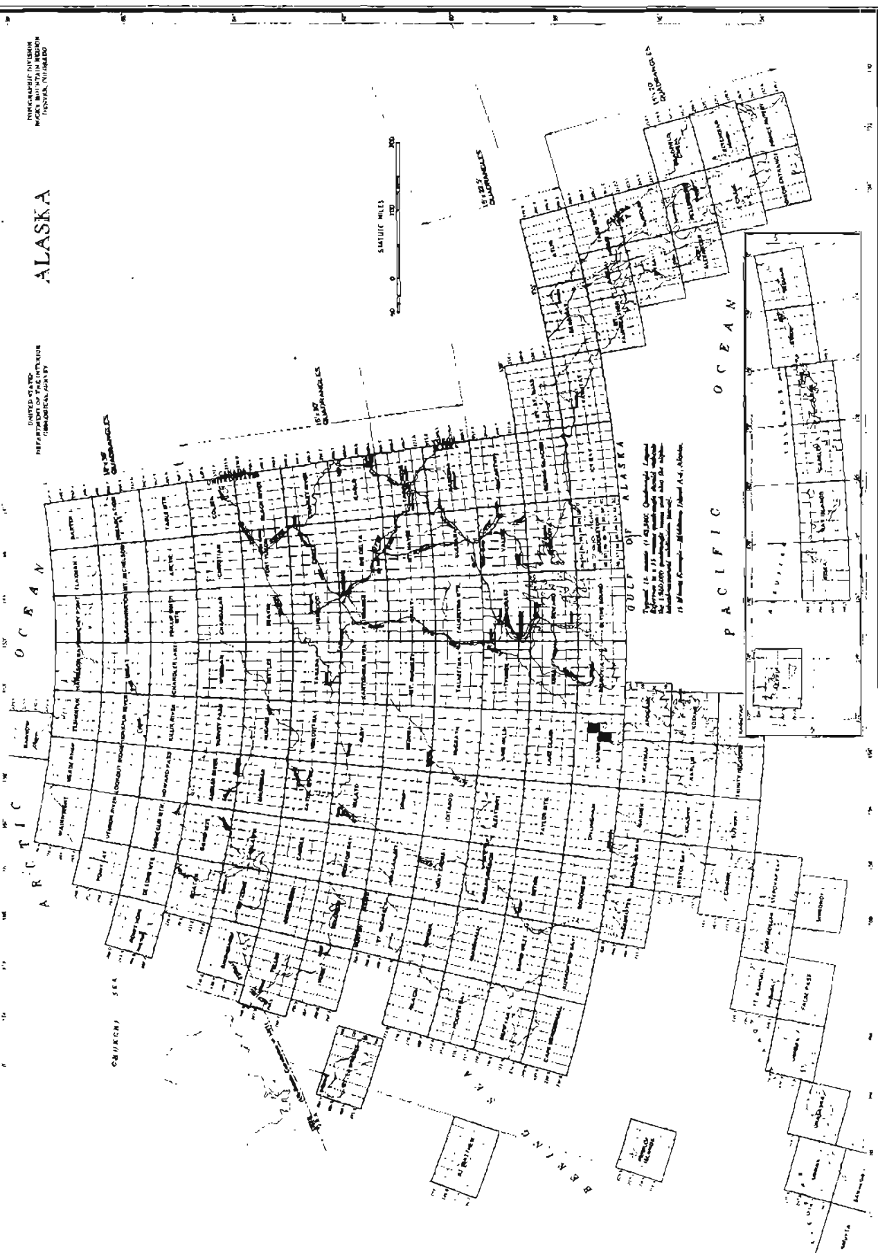
Figure 1 Index map showing location of Iliamna B-3 (Bruin Bay) and C-2 (Iliamna Bay) quadrangles, Alaska